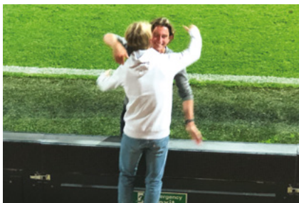
Thomas Frank embraces his son at pitch-side

After the game Thomas Frank said the team had been irritated by the outcome of the first leg and that had been a driving force for the second. He'd told the team: 'we can't not win in the final game at Griffin Park'. The players had been shown a video in which Bees fans talked about how important the game was to them.