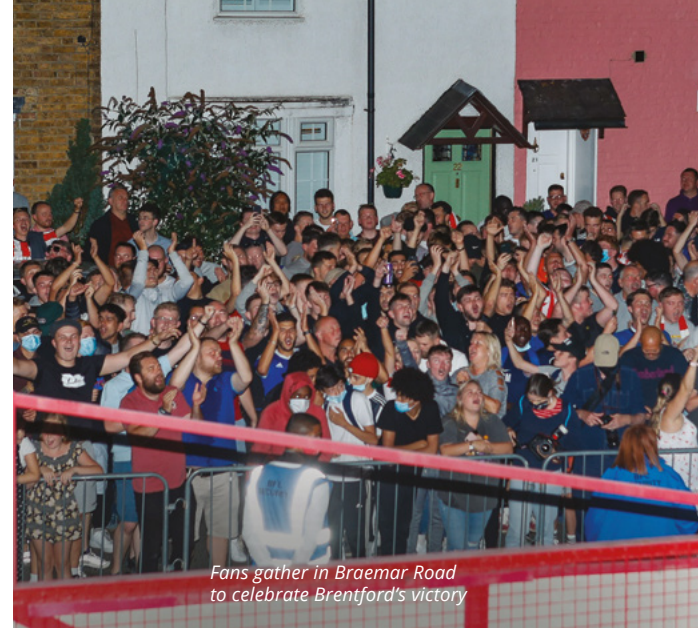
Fans gather in Braemar Road to celebrate Brentford's victory