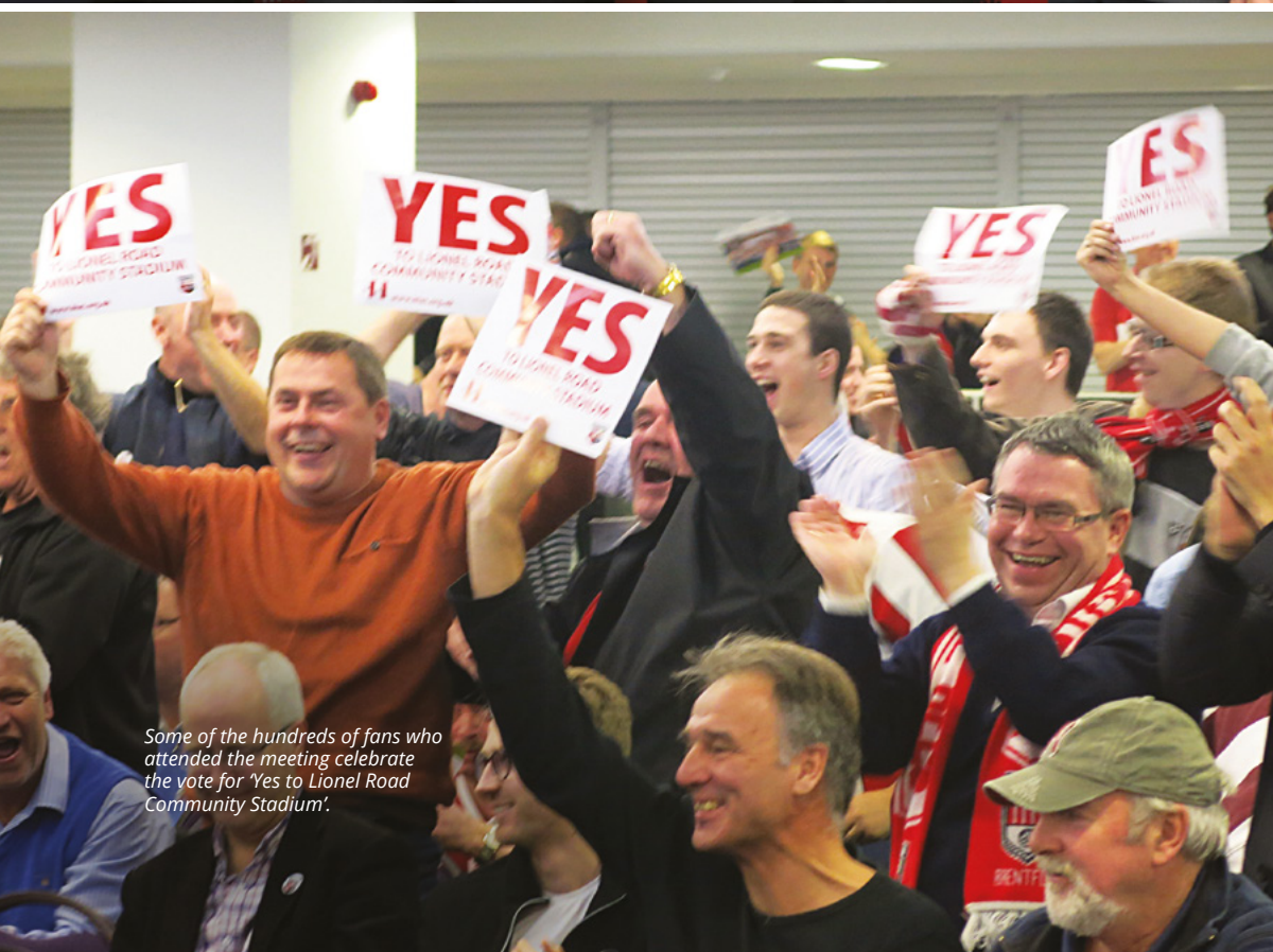
Some of the hundreds of fans who attended the meeting celebrate the vote for 'Yes to Lionel Road Community Stadium'.